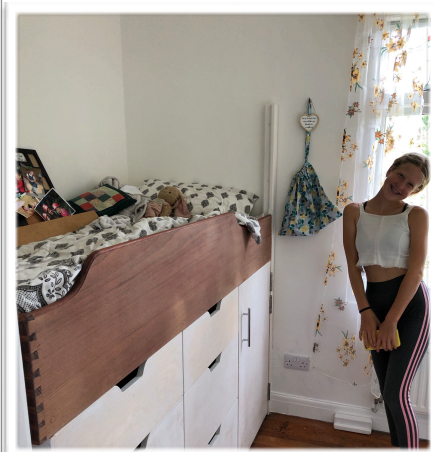
We hid the stairs in the cupboard, so it's all neat .

The bed had to neatly and completely fill the gap created by the moved wall. It would consist of a bed on top of extensive storage. There also had to be safe access. The style, in Mea's words, "is EXACTLY what I had in my head".